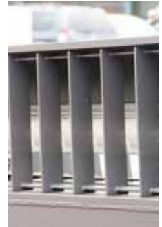
Noordbrug Kortrijk Bridge