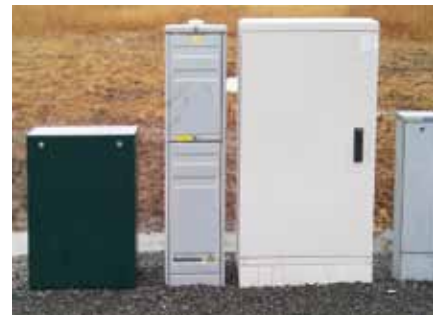
Göteborg Energi cable cabinets